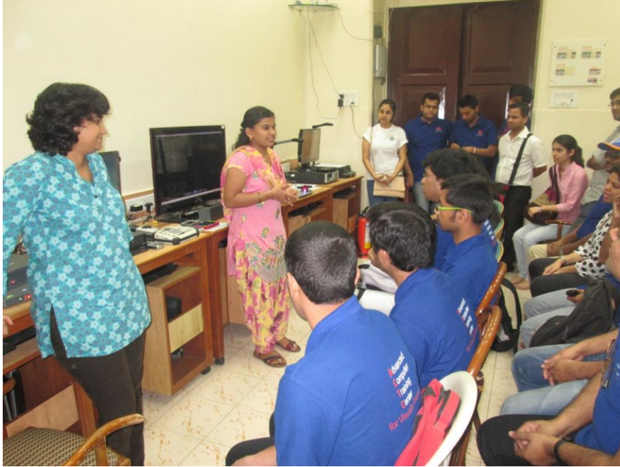
An Assistive Technology training workshop at the XRCVC