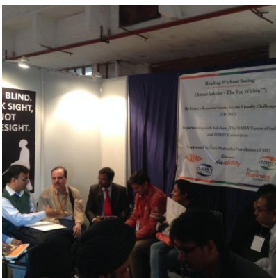
Participants at 'Reading Without Seeing: Antarchakshu – The Eye Within™', organized by the XRCVC for the publishing community at the Delhi World Book Fair