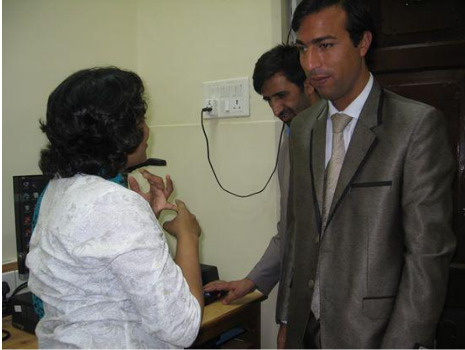
Two visually impaired teachers from Kabul being trained at the XRCVC

Volunteer Services: Our volunteer services this year worked with a robust strength of 132 volunteers, drawn from the college's Social Involvement Programme (SIP). These volunteers helped our members in various ways—from creating accessible print and audio content, to reading study material, helping with individual and group teaching assignments, and as writers for exams.