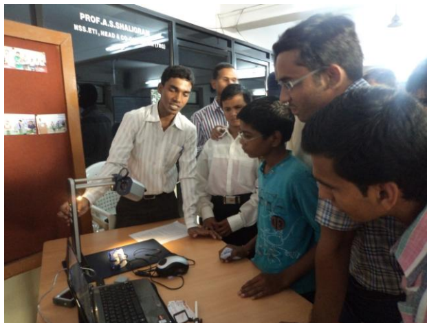
Technology being displayed to visually impaired participants at a 'Reading Without Seeing' seminar organized by the XRCVC