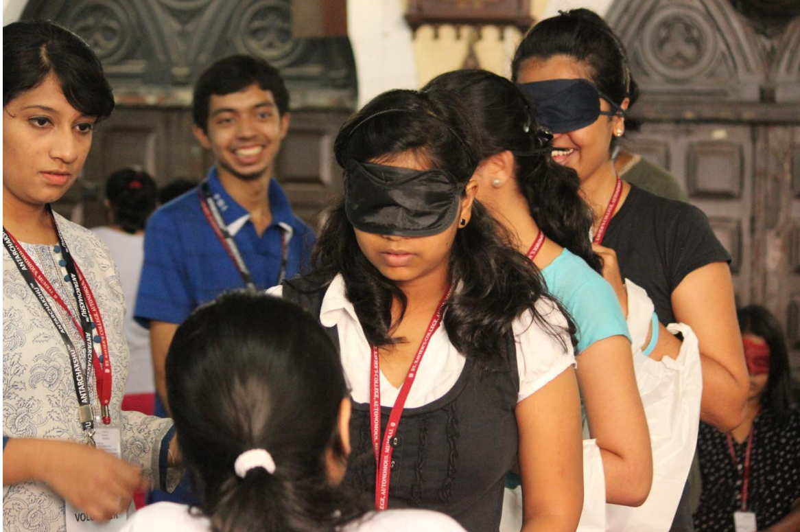
Blindfolded participants at Antarchakshu—The Eye Within™, the XRCVC's mega sensitization and awareness programme organized annually in Mumbai at St Xavier's College