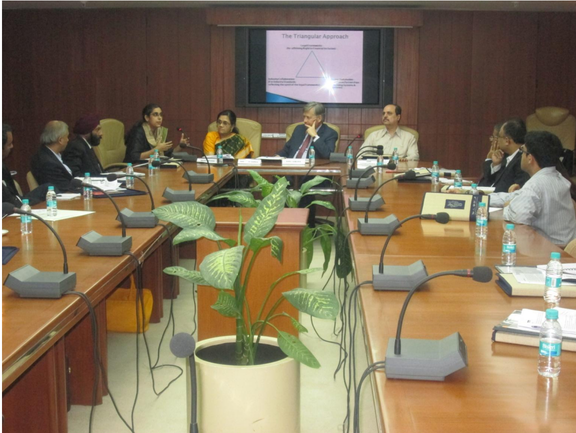
Deliberations at a 'High-Level Meeting on Inclusive Financial Services' organized in Mumbai by the XRCVC, along with G3ict and Indian Banks' Association (IBA)