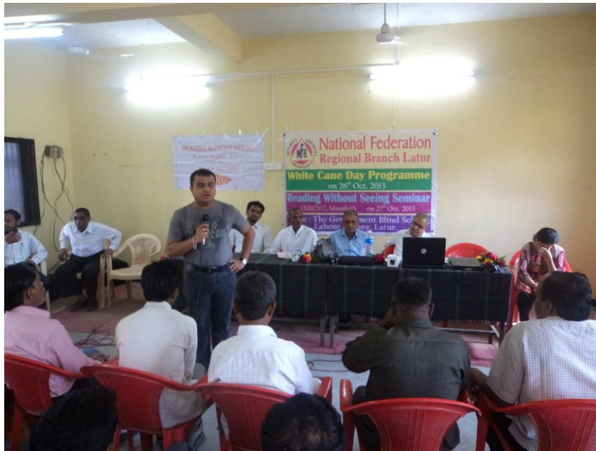
A 'Reading Without Seeing' seminar organized by the XRCVC at Latur