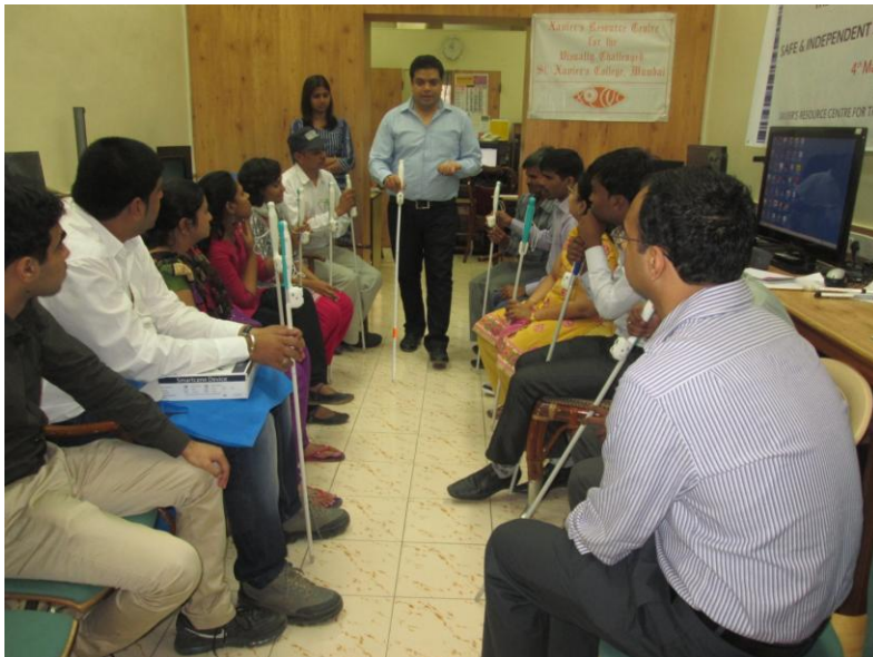
A testing and training programme for the Smartcane Device for the Blind at the XRCVC

During the year, the XRCVC worked closely with IIT Delhi and Saksham Trust in the development and testing of a Smartcane Device for the blind. The device, an electronic, ultrasonic unit that can be fixed on the top fold of the regular white cane to detect obstacles above knee-level at a distance ranging from one metre to three metres, was launched in Delhi in March 2014.